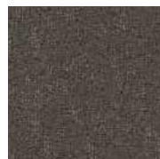
LRV 11 L 39 850