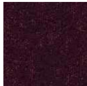
LRV 4 L 20 352