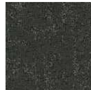
LRV 8 L 32 961