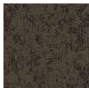
LRV 8 L 34 668