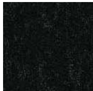
LRV 3 L 17 966