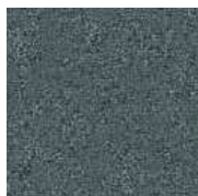
LRV 14 L 44 586