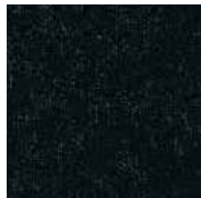
LRV 3 L 16 592