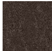
LRV 7 L 30 810