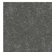
LRV 14 L 44 983