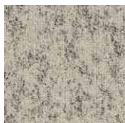
LRV 38 L 68 130