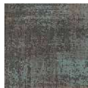
LRV 17 L 48