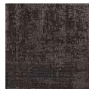
LRV 6 L 29