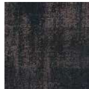
LRV 7 L 32