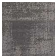
LRV 16 L 47