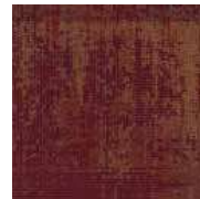
LRV 8 L 33