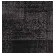
LRV 5 L 27